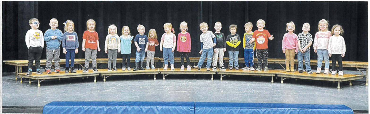
Morning Preschool's first time practicing concert songs on the stage!

We wish each of you a safe, healthy and restful holiday, and a wonderful new year!