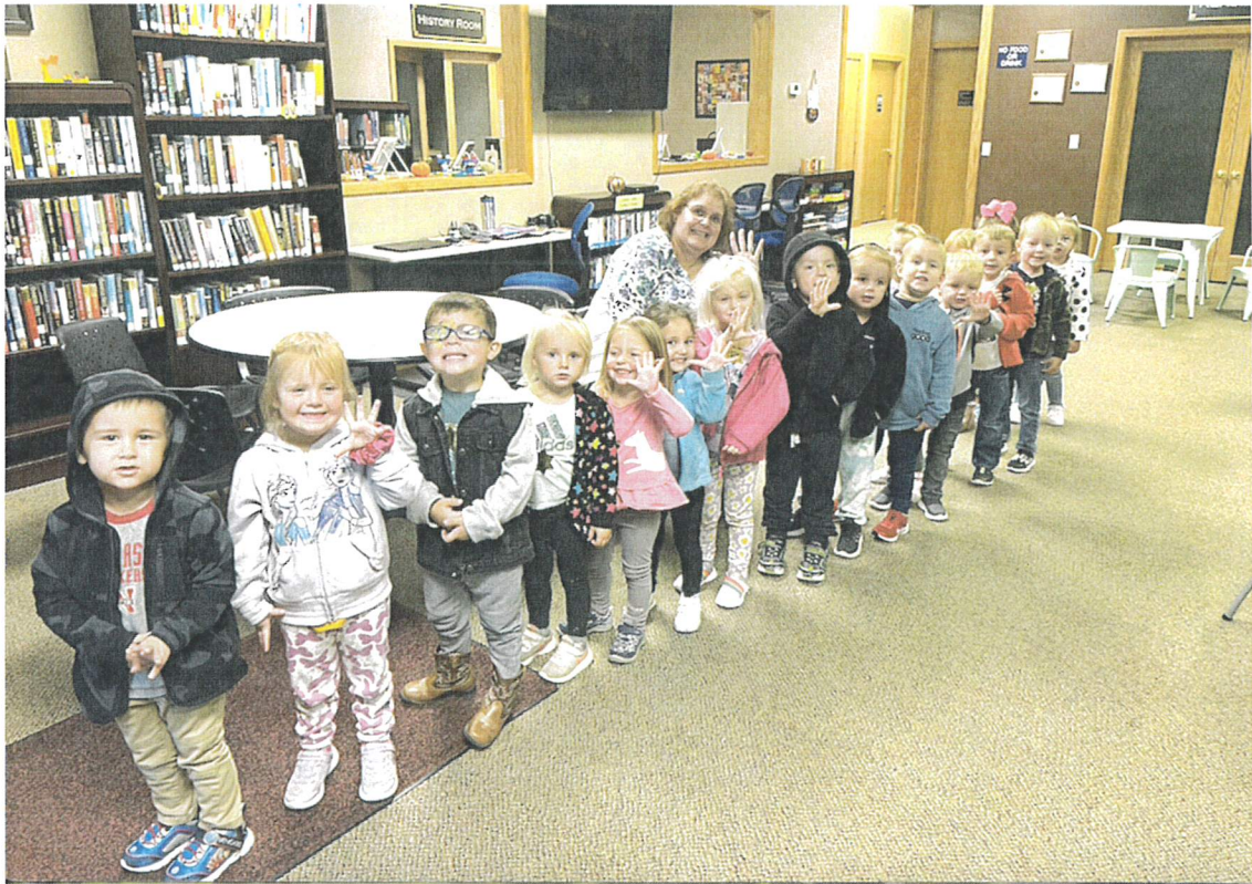
Our Partnership with Leigh Public Library continues to help our students experience the love of reading!