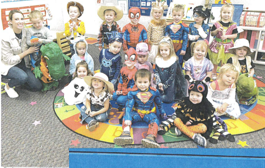
Pre-K Halloween Party 2023– Thank you to our Volunteers that made our parties a success!

What a semester! We are so proud of our students! We have made so many memories and have had many reasons to celebrate! Each day has been an adventure, and an opportunity to learn and grow. As we begin to “wrap-up” our first semester together, we wanted to share a glimpse into all the fun we have had.