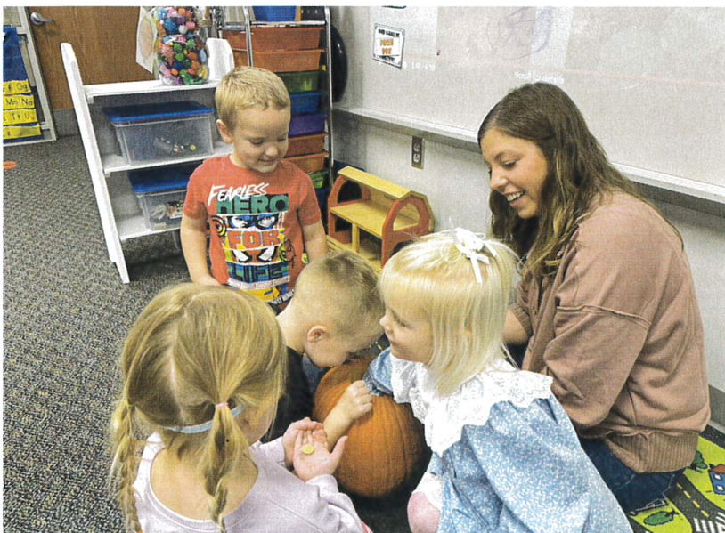
Little Sprouts, our FFA Partnership has been an incredible learning opportunity for our students!